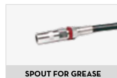
SPOUT FOR GREASE